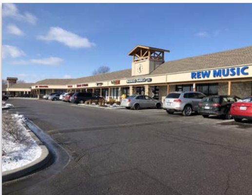
Pictured: Greystone South Shopping Center