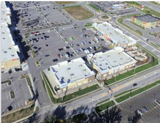
Pictured: Liberty Commons Shopping Center