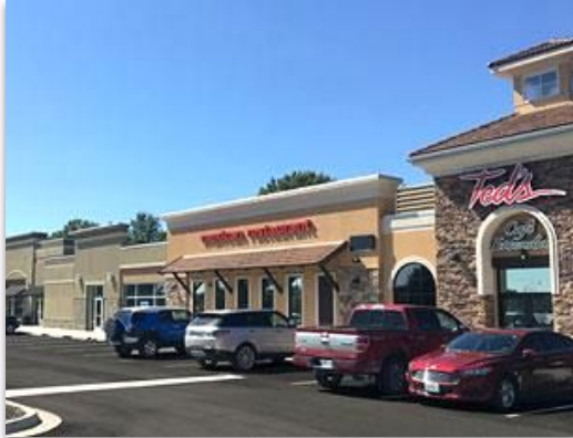
Pictured: Valle Vista Shopping Center